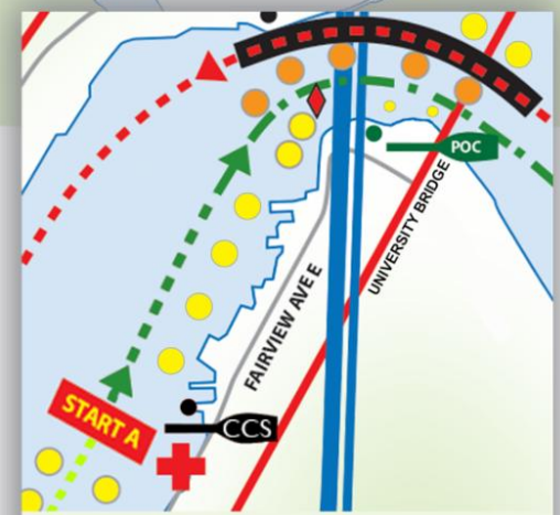
Pocock Turn Detail

Warmup: Go through the arch to the north of the wide arch Racing: Go through the wide arch, keeping all yellow buoys on your starboard side and all orange buoys on your port.